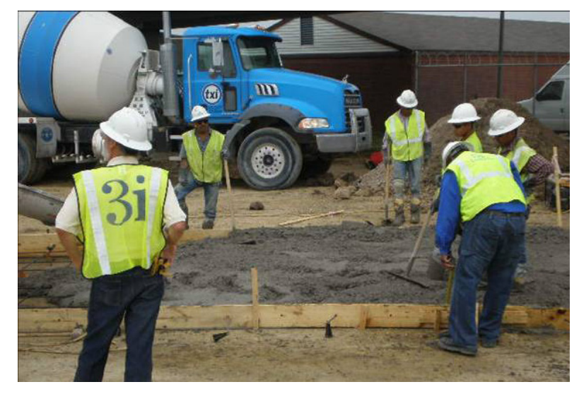
By Self-Performing many of the areas of the construction process, our team's primary goal is to satisfy the needs and exceed the expectations of our clients.

• The development of our electrical and roofing divisions will continue to provide our clients a quality project at a more energy-efficient delivery and price.